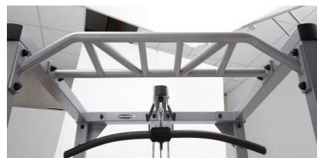
Optional for lat attachment and stacks