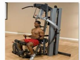
F600 Seat Curl