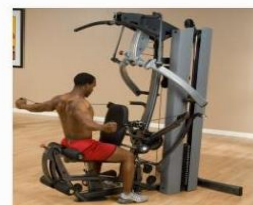
F600 Rev Fly