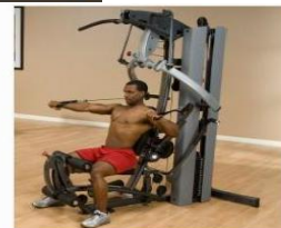
F600 Arm Seat Press