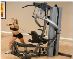
F600 Arm Press