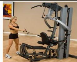
F600 Arm Rev Fly