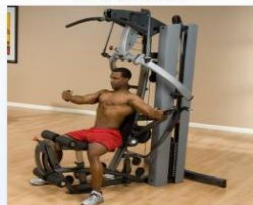
F600 Seat Fly 2