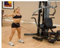
F600 Arm Raise