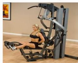
F600 Leg Ext