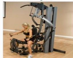
F600 Seat Fly