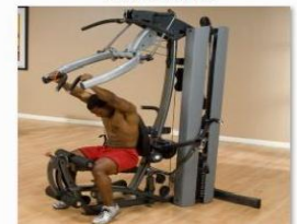
F600 Seat Shoulder Press