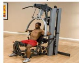
F600 Seat Press