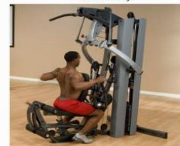
F600 Seat Row