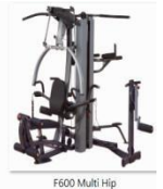
F600 Multi Hip