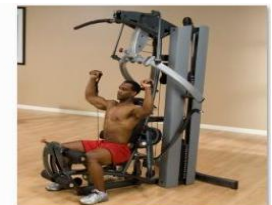
F600 Arm Shoulder Press