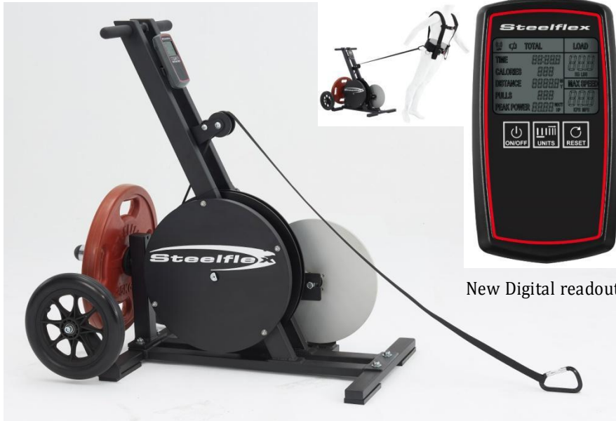
New Digital readout

The Power Runner FPR-112 is the only that mimics the natural resistance an athlete feels when free running, just amplified. The resistance is linear and completely smooth, with no dangerous pullback. This makes the Power Runner FPR-112 the ideal tool for training an athlete to maximum potential. When you want speed, there is no substitute.